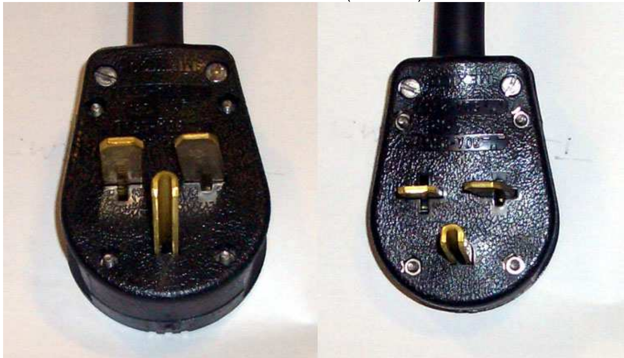
PICTURE OF PLUG SUPPLIED ON STANDARD 394 PRESS

The machine is normally shipped with a 220v-30 amp power cord and plug. It is recommended that in either size machine be plugged into a 30 amp single phase outlet. This is to insure proper voltage and reduce any issues with heat recovery. Check with your local electrical code for specific requirements depending on actual loads. The 394-TS (16" x 20") can be plugged into a smaller 20 amp service, check with you local codes and a professional electrician to confer.