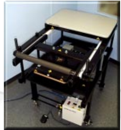
Shown with optional top work table and casters

The 898 AirPro is a high production air operated heat transfer press. Designed with high speed fusible graphics and demanding heat transfer applications in mind, the 898 AirPro delivers productivity far beyond standard heat transfer machinery.