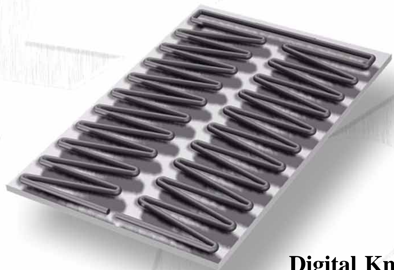
Digital Knight SuperCoil Microwinding™