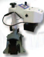
Pictured with optional cap attachment