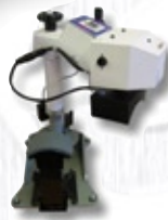
Pictured with optional cap attachment