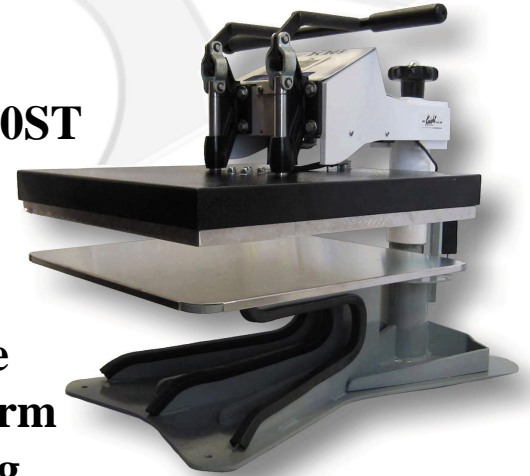
The Uniform King

Because of the unique custom design of the DK1820 series heat press, it is also aptly named The Uniform King .