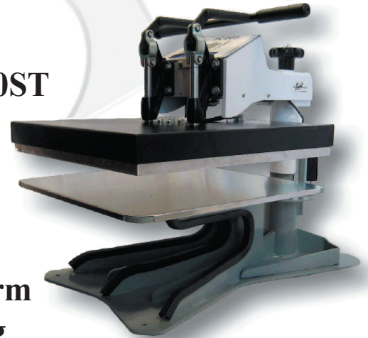
The Uniform King

Because of the unique custom design of the DK1820 series heat press, it is also aptly named The Uniform King .